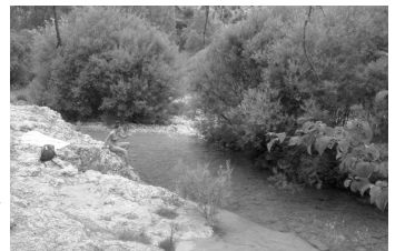
Café Solo: odd name, a quiet spot.

Cafe Solo ★☆☆ This is upstream of Los Estrechos. Drive round