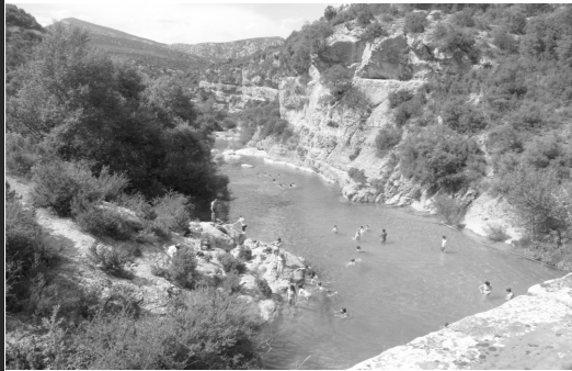
Puente Pedruel: kids enjoying their first day.

Puente Pedruel ★★★★★ 2Km south of Rodellar. Turn off the HU-341 for "Camping 800m" N42.27088° W0.07999°. Limited