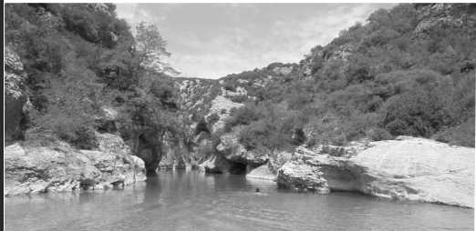
Los Estrechos: Fina explores.