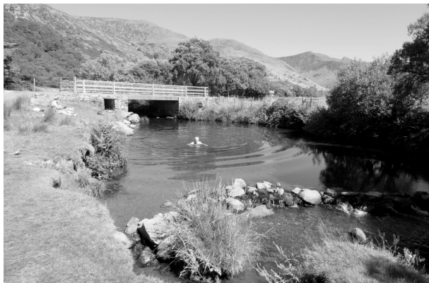
Cwm Pennant: far up a remote valley, but popular.

SH480395. Only about 6ft depth at the most. Beach entry with a swing. Popular, but the water is cold. There are several other pools downstream, but they are fished and they don't have such good picnic grass